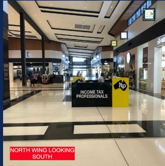
NORTH WING LOOKING SOUTH